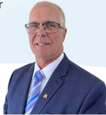
Cr Les McPhee Mayor, Swan Hill Rural City Council

You can keep up to date on services and projects by visiting www.swanhill.vic.gov.au or by following our Facebook page.