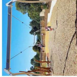
06/ Flying fox (DDA)