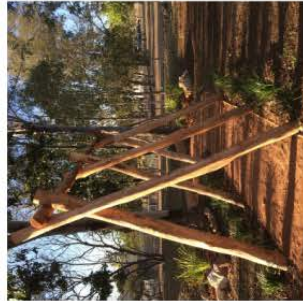
05/ Low tee-pee tunnel