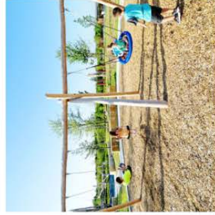
08/ Swing and basket swing (DDA)