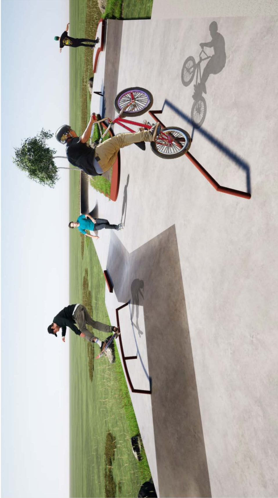
PERSPECTIVE - 03