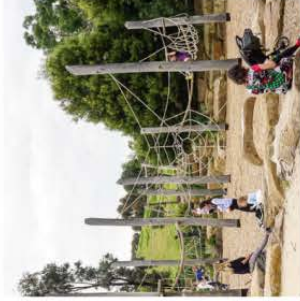
02/ Balancing ropes