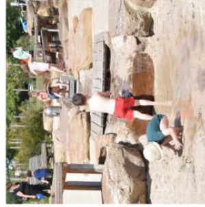
12/ Dry creek including timber bridges