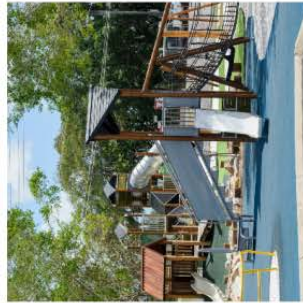
07/ Play tower (DDA)