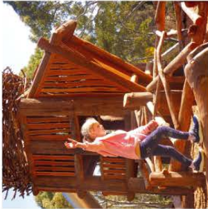
01/ Balancing beam