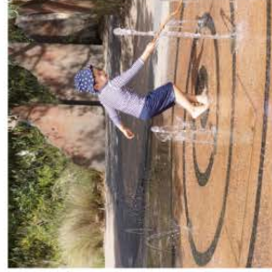
10/ Water sprinklers (DDA)