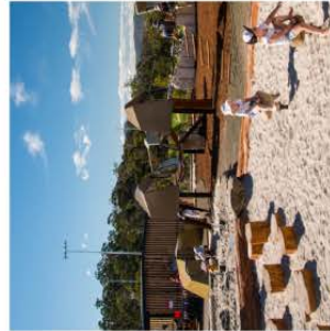
09/ Sand play area with timber edge seating