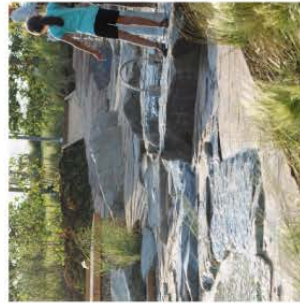
11/ Water play area