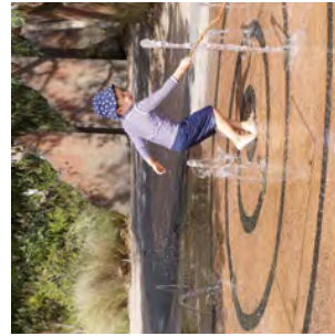
10/ Water sprinklers (DDA)