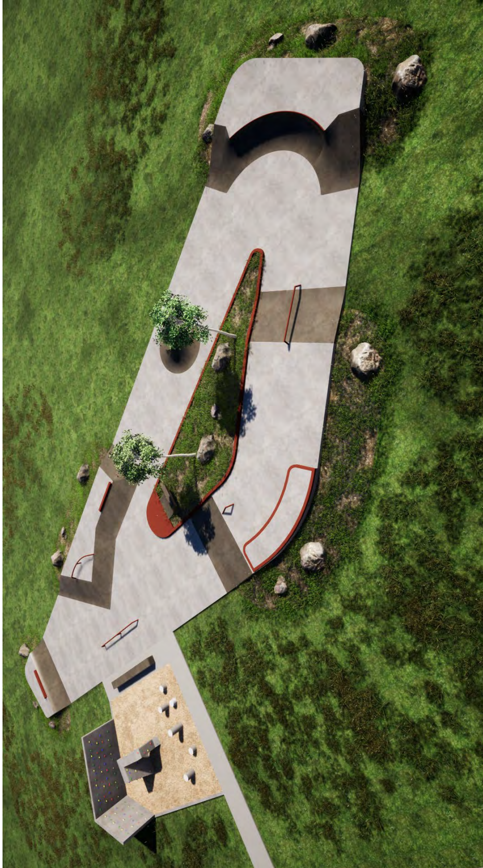
PERSPECTIVE - 01