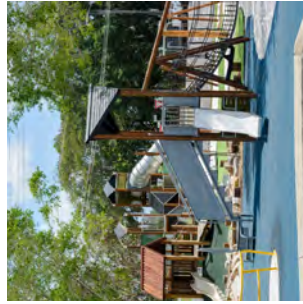
07/ Play tower (DDA)