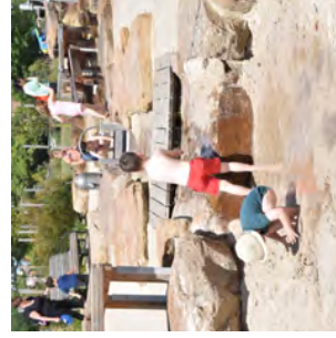
12/ Dry creek including timber bridges