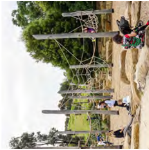
02/ Balancing ropes