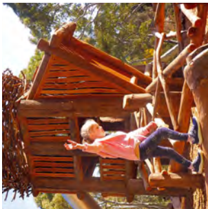
01/ Balancing beam