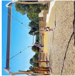
06/ Flying fox (DDA)