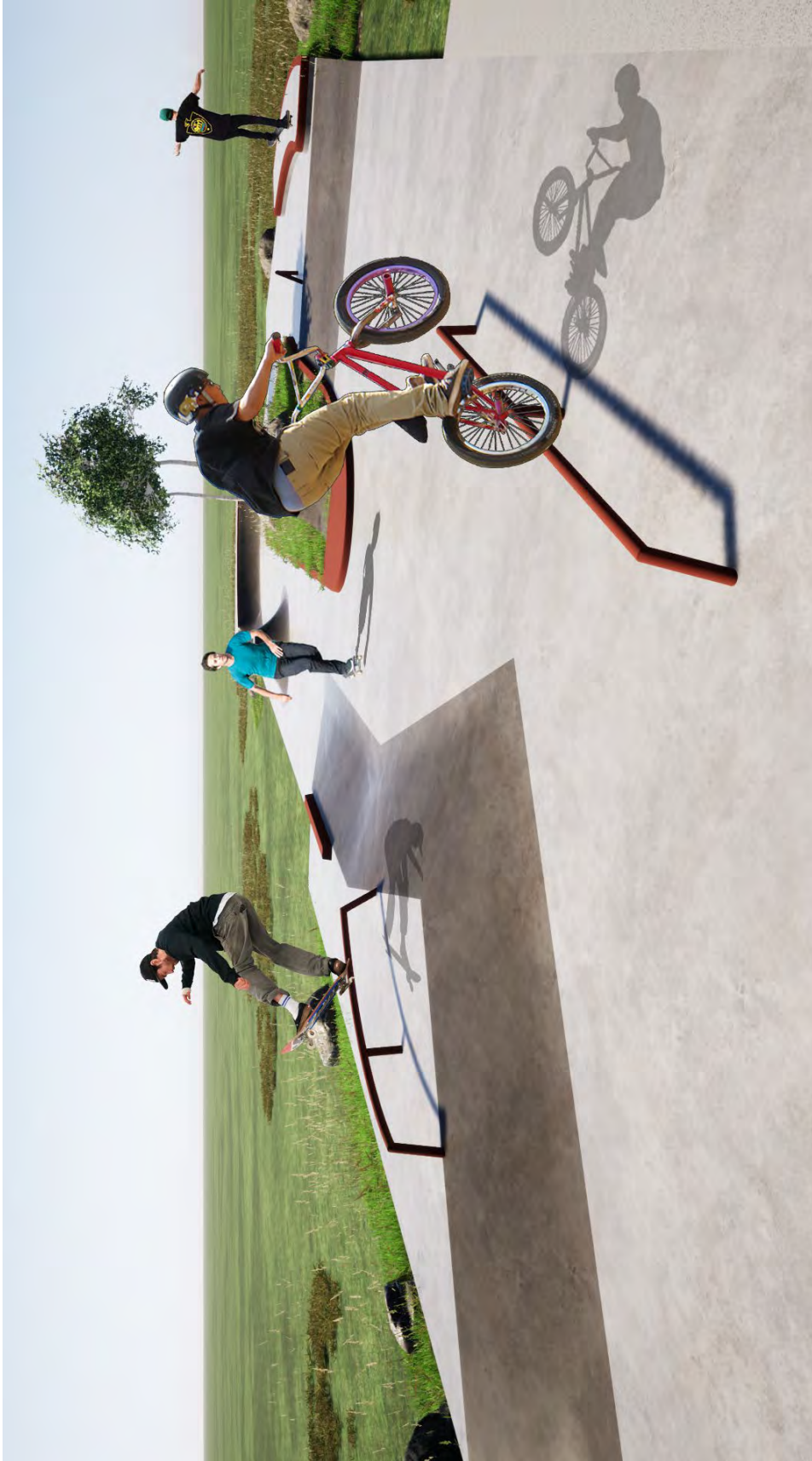
PERSPECTIVE - 03