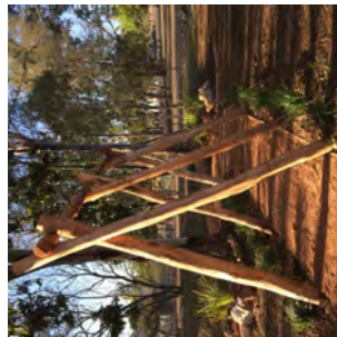
05/ Low tee-pee tunnel