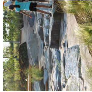
11/ Water play area