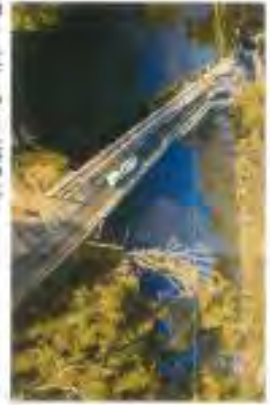
The existing Swan Hill Bridge

The document contains proposed information about Transport for NSW's preferred option for a future bridge at Swan Hill. It is intended to provide information to help inform the community about the project and the preferred option. It is not intended to be a final decision. The project team will continue to work with the community to develop a preferred option for a future bridge at Swan Hill.