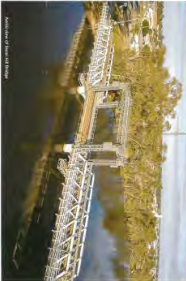
Aerial view of new bridge