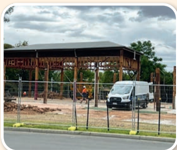
The exciting Swan Hill Art Gallery redevelopment is well underway

Recreational Vehicle travellers can now access two new dump points: at the Swan Hill southern entrance toilet block and at the Gray Park public toilets on Marraboor Street, Lake Boga.