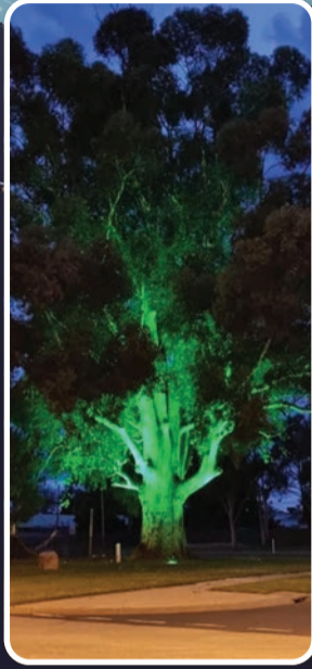
New lighting activation in Nyah West.