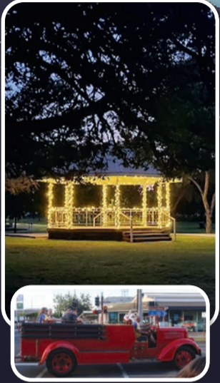
Swan Hill Rural City Council is delighted to be sharing Christmas spirit right across the municipality.

It's beginning to look a lot like Christmas