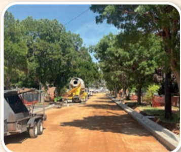
The Long Street road reconstruction works.