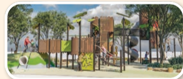
Construction is set to commence soon for Robinvale Nature and Adventure Play.