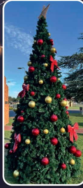
The magic of Christmas has arrived in Robinvale

A crowd of approximately 300 people gathered to embrace the Christmas spirit during the inaugural Christmas tree lighting event at the Clock Tower in Swan Hill on 21 November.