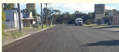
Dillon Street, Ultima