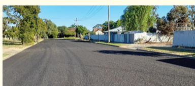
Rainbow Street, Manangatang