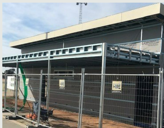
Progress at the Lake Boga Netball Club changeroom facility.

Additional play equipment has been installed at the Riverside Park at Swan Hill - sure to keep the little ones entertained.